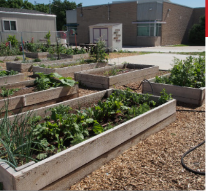
Student and family garden at the Community Learning Center.